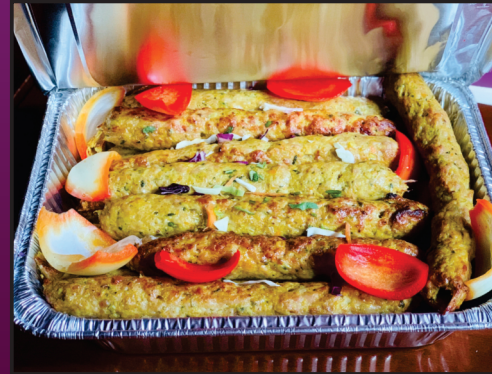
Lamb and Chicken Seekh Kabab